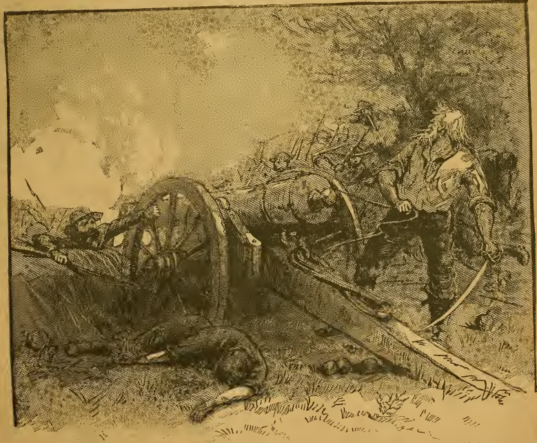
The old cannoneer sticks by his gun in the slaughter on the Antietam.